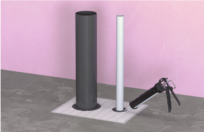
QuelStop Fire Batt used in conjunction with QuelStop HPE Intumescent Graphite Sealant