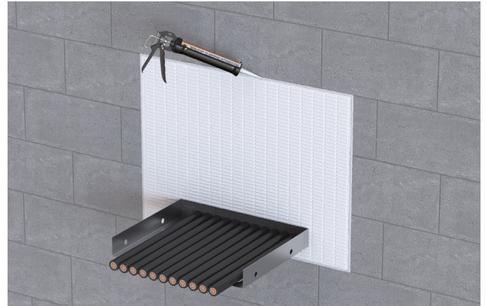
QuelStop Fire Batt used in conjunction with QuelStop Intumescent Acrylic Sealant