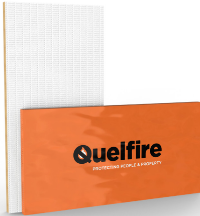
QuelStop Fire Batt

QuelStop Fire Batt is a coated mineral wool board used to reinstate the fire rating of wall and floor constructions where they have been penetrated by services.