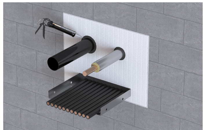
QuelStop Fire Batt used in conjunction with QuelStop HPE Intumescent Graphite Sealant around the pipes

Ensure that you install the QuelStop Fire Batt with at least 75mm overlap and fix it to the substrate with the minimum 80mm steel screws and penny washers at maximum 300mm centres overcoated with QuelStop Coating. Coat all joints using QuelStop Intumescent Acrylic Sealant and ensure all leading edges of the QuelStop Fire Batt are coated with QuelStop Intumescent Acrylic Sealant.